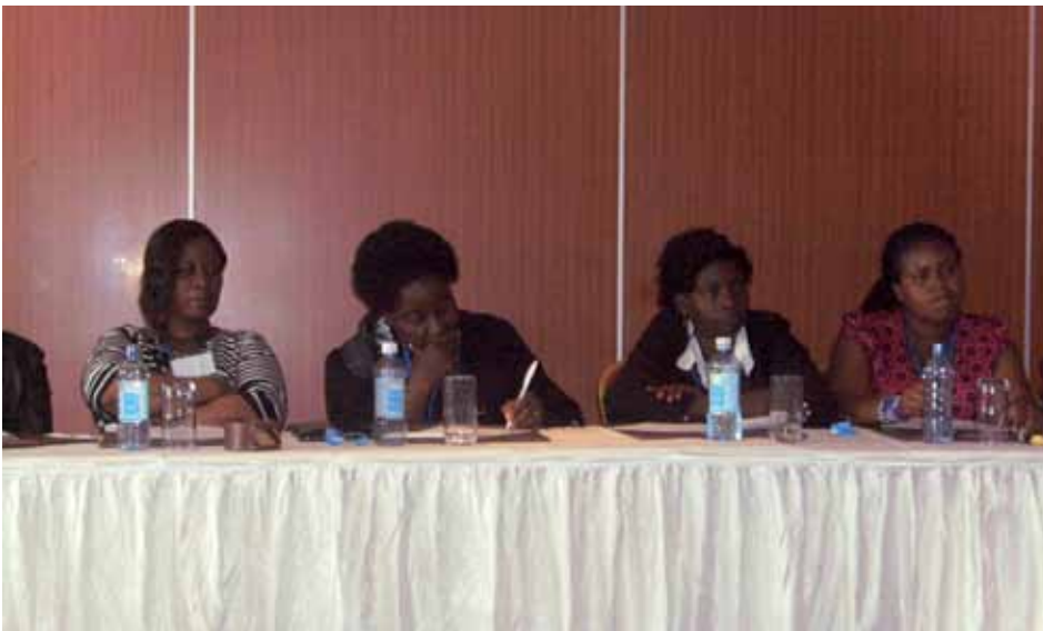
Delegates from Uganda who participated at the RT in Kenya

For me, Kenya was a revelation. It reminded me of India in many ways. The people are warm and hospitable; their food may be different but their ways of living are similar and they seem to be facing the same problems we do – corruption, poverty, a lack of education among the poor and a large population. However, I also perceived some differences. They are very proud of their country; as a people they are upbeat and despite the tribal conflicts which they face, they are anxious to move ahead.